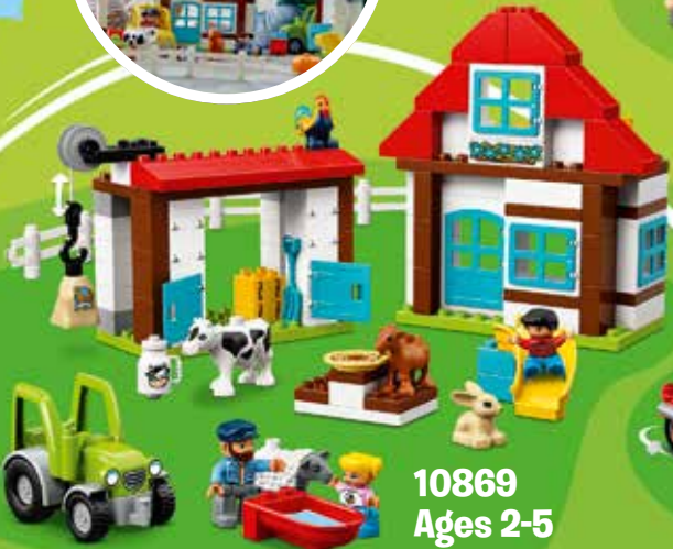
10869 Ages 2-5